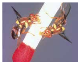
Queensland fruit flies. DEPI Vic

Spread: By the movement of uncertified host fruit out of infested areas. Most fresh fruits, including capsicum, chillies and tomatoes, are fruit fly hosts.