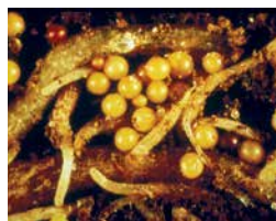
PCN-infested potato roots. DEPI Vic.

Spread: By the movement of host plants or of soil attached to plants, bulbs, advanced trees or agricultural equipment.