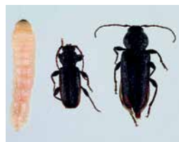
(L-R) EHB larva, male adult and female adult. DAF WA

Spread: By the movement of infested host timber, including building materials, wooden pallets and pine furniture.