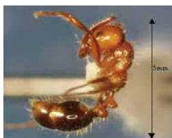
Red imported fire ant.

Spread: By the movement of infested materials such as pot plants, soil, mulch and timber.