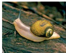
Green snail. DAF WA

Spread: By the movement of host plant material.