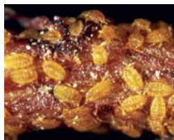
Phylloxera aphids.

Spread: By the movement of grapevine rootlings, equipment and soil from infested areas.