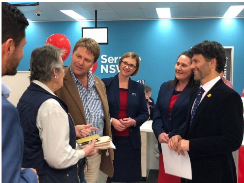
Service NSW opens its doors in Hay and Leeton

It was a pleasure to be a guest at the Murrumbidgee Police District Medal and Awards Ceremony in Griffith on Tuesday. Congratulations to all those who received awards and medals, and also to those who took their affirmations and oaths of office. Thank you for the incredible job you do each and every day!