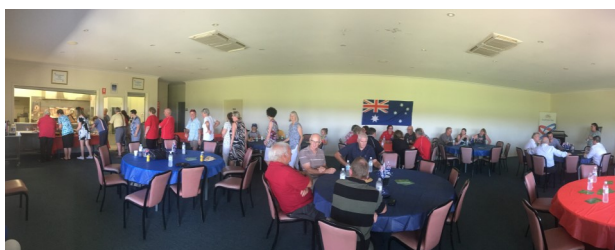
Pictured left: Euston audience queues for lunch

The celebrations then moved to Euston where a BBQ lunch was held and an afternoon ceremony in which two further awards were presented. There was a good crowd of approximately 60 people in attendance and it was wonderful to see so many people coming together to celebrate.