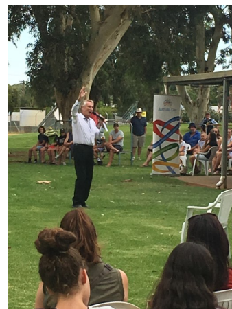
Pictured right: Frank Ifield OAM speaks to the Balranald audience

Congratulations to all our Award recipients: