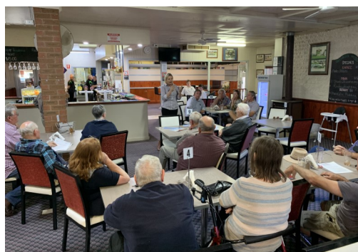
Pictured: (left) Hon Barnaby Joyce MP at Homebush Hotel with members of the community, (right) Hon Sussan Ley MP addresses the gathering at Shamrock Hotel.