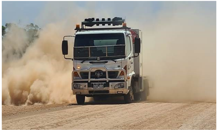
Preparations for sealing works at the Marma – Box Creek Road

Proposed widening of Main Road 296 (Kyalite – Moulamein Road) from the Kyalite Caravan Park entrance to the Shire boundary has been deferred until after the current harvest season.