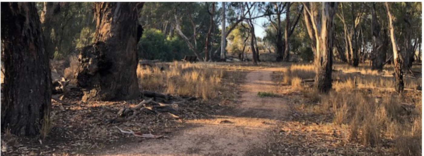
Existing dirt track at Balranald Riverfront

Aerodrome - an application is being submitted for funding under the Remote Airstrip Upgrade Program (RAUP) to install kangaroo-proof perimeter fencing and seal pavement cracks.