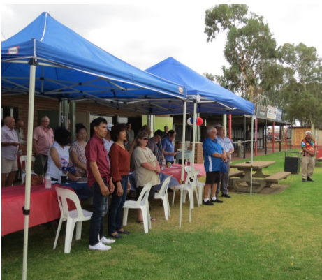
Crowd at Euston Ceremony