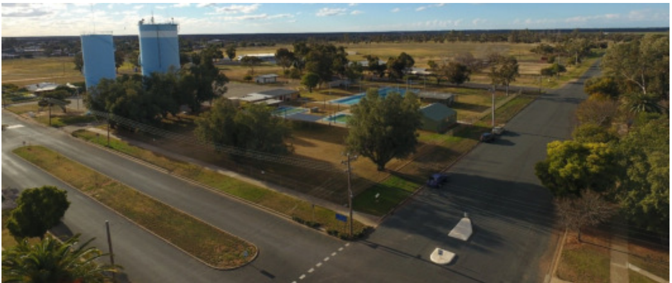
View to the Balranald Water towers, Pool and Greenham Park

Work has commenced on cathodic protection of the Euston filtered water reservoir and a contract has been awarded for upgrading the switchboards at the main pumping station.