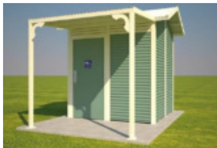
Proposed toilet at Balranald Cemetery

In consultation with the Balranald Beautification Advisory Committee, a design has been selected for a toilet at Balranald Cemetery