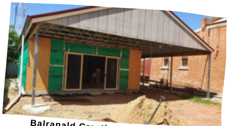
Balranald Creative Learning Centre