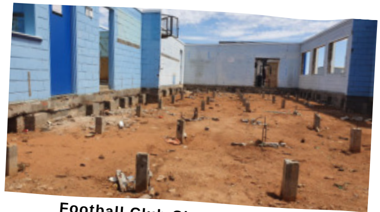
Football Club Change Rooms

A new modular toilet building has been purchased and will be erected shortly.