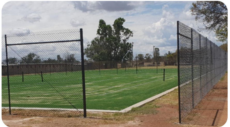
Fencing Nearly Complete on New Artificial Surface Tennis Courts

The car park sealing will hopefully be completed in February – subject to contractor availability