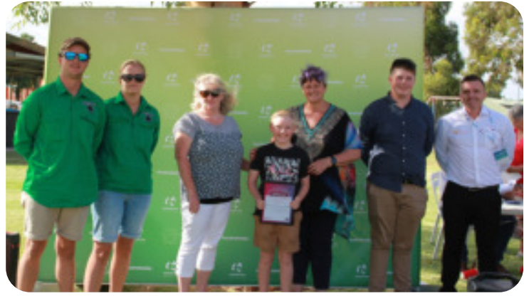
Community Event of the Year - Homebush Rodeo