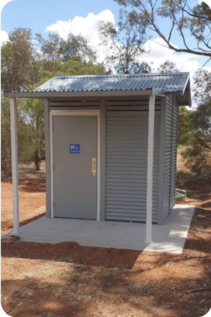
New Toilet Facility at Balranald Cemetery

A new modular toilet building has been installed in a discreet, but accessible corner of Balranald Cemetery.