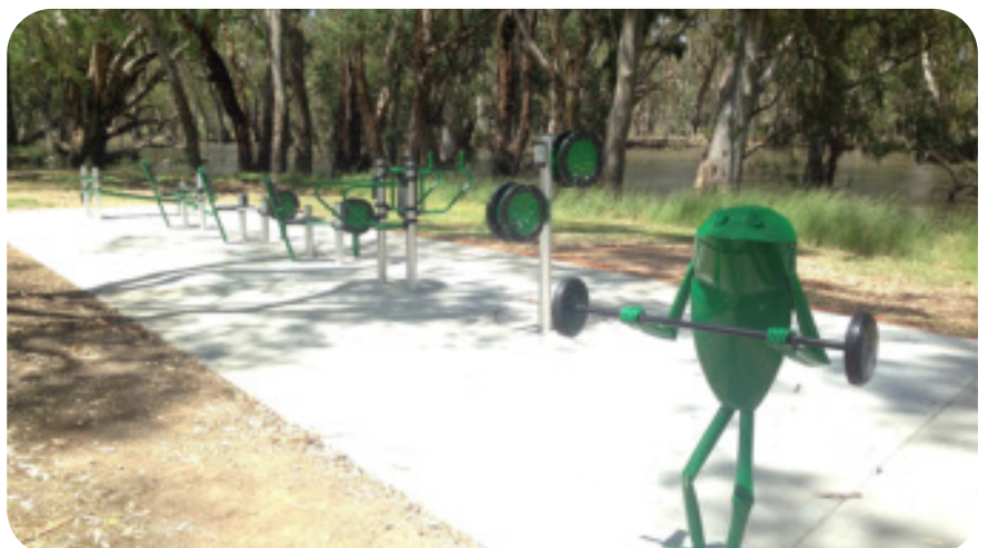
Outdoor Gym Equipment in Balranald now available for Use

Outdoor gym equipment has been installed along the river at the end of Mayall Street. This area is completed with the installation of furniture and a weight-lifting frog sculpture except for 1 item that we are still waiting for the part to be delivered. The drinking fountain, rubbish bin and doggy bags dispenser will be installed soon.