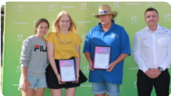
Sporting Team of the Year - Balranald Football Netball Club's A Grade & Under 18s Team