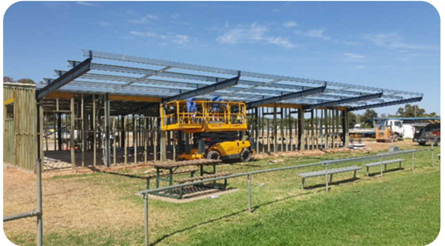
Football changerooms under construction at Greenham Park

Building work on the new changerooms is progressing. This new facility will have separate male and female team changing rooms and bathrooms, male and female umpires' rooms and a coaches' room.