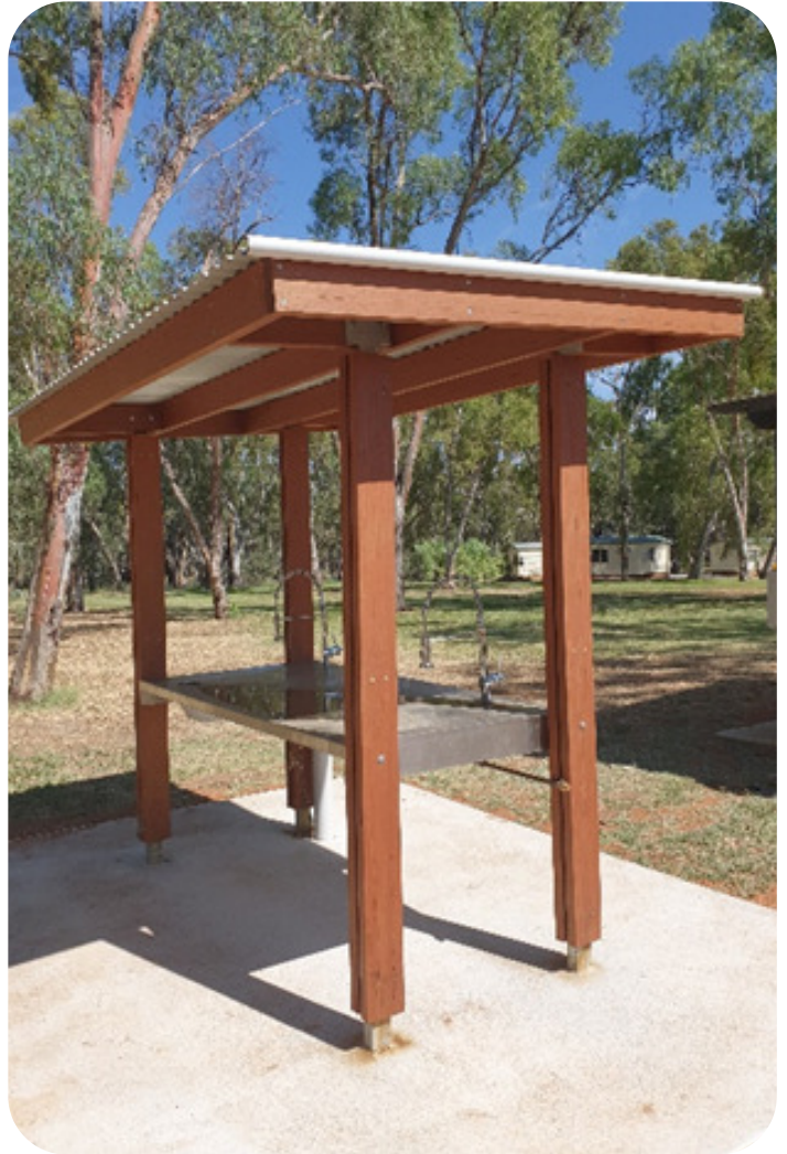
Fish Cleaning Station at Balranald Boat Ramp