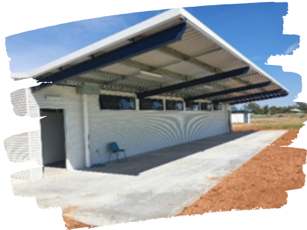
Balranald Football Club Changerooms

Internal fit-out is approaching completion with installation of lino flooring, tiling, showers and toilets. Completion is expected in one to two weeks, ready for the first game of the season on 2nd April.