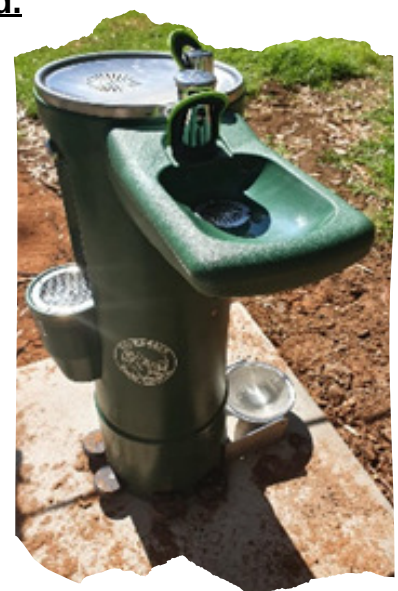
Drinking Fountain at the Balranald Riverbend