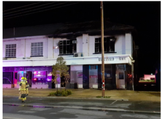
The third set of windows was the upper floor of the Can Assist Bookshop.