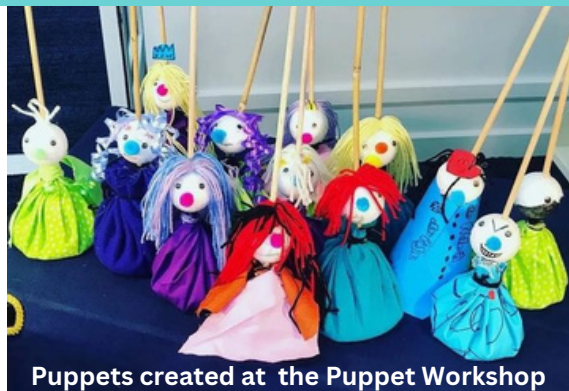
Puppets created at the Puppet Workshop

"The incredible young puppet builders became puppeteers before our eyes, delighting us with their characters and stories!"