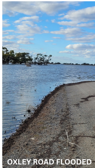
OXLEY ROAD FLOODED

The road has been severely damaged by storm and floodwater in approximately ten locations. Contractors will commence repair works, once works on Prungle Mail Road are completed.