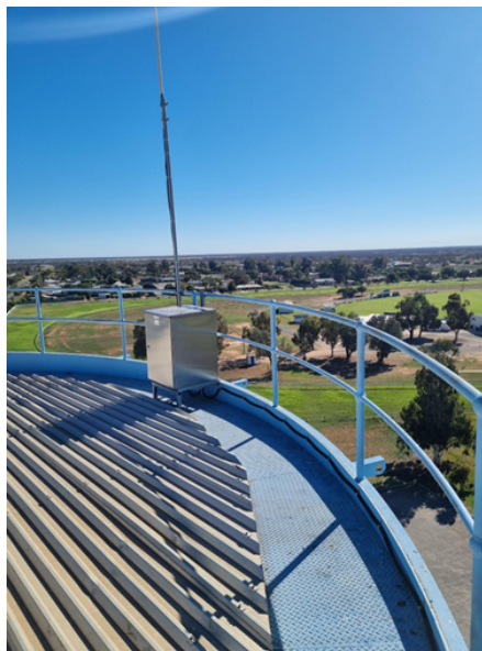
VIEW FROM TOP RAW WATER RESERVOIR BALRANALD MAY 2025

For further information or queries please email Council at council@balranald.nsw.gov.au or call on 03 5020 1300