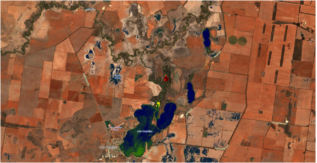
Figure 3. Lake Cargelligo 14/01/2026 Sentinel Hub [CC BY-NC 4.0] NSW-Custom Algae Script - TF, WaterNSW