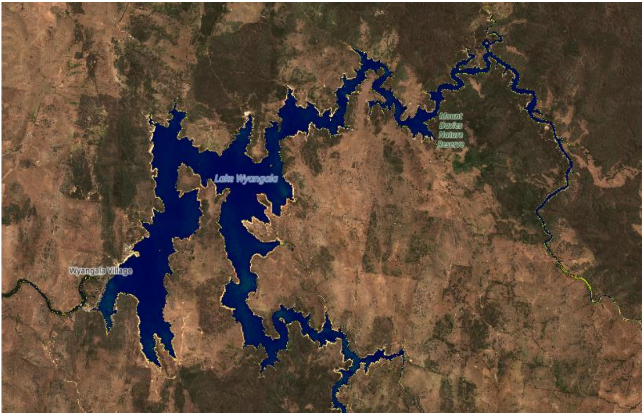
Figure 1. Wyangala Dam 08/01/2026