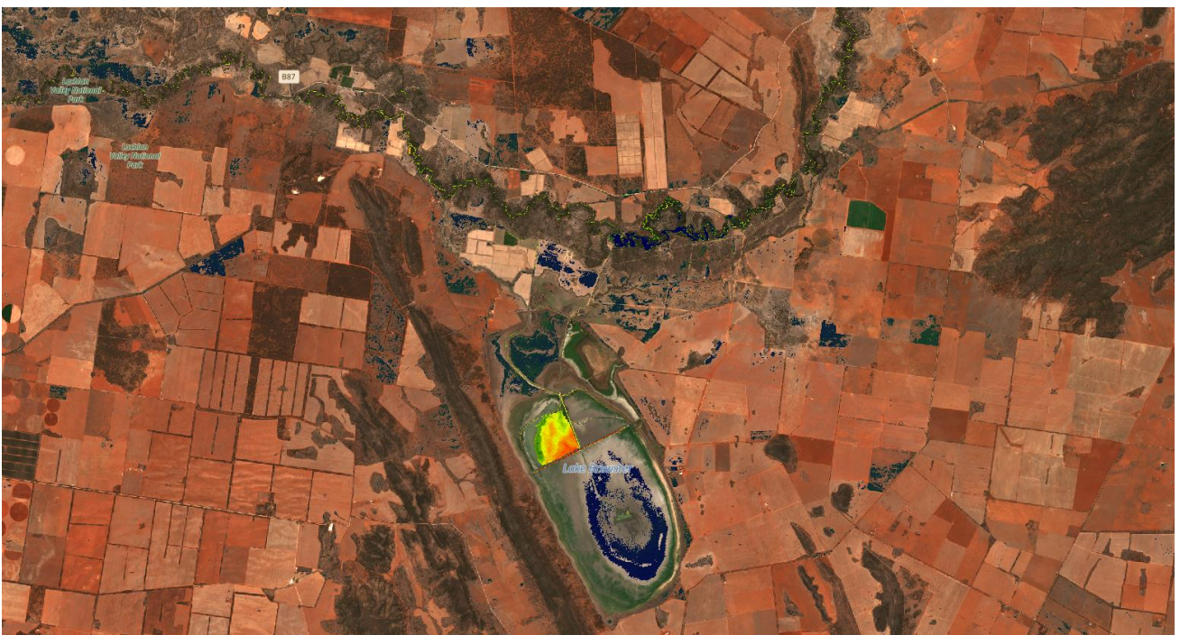
Figure 4. Lake Brewster 14/01/2026 Sentinel Hub [CC BY-NC 4.0] NSW-Custom Algae Script - TF, WaterNSW.