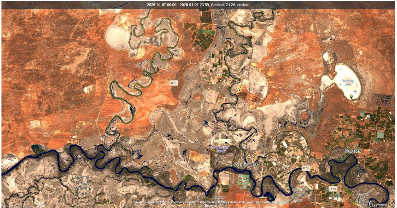
Figure 3: Murray River near Wentworth, Lower Darling River and Great Darling Anabranch 07/01/2026 SentinelHub [CC BY-NC 4.0] NSW- RACC Custom Algae Script - TF, WaterNSW.