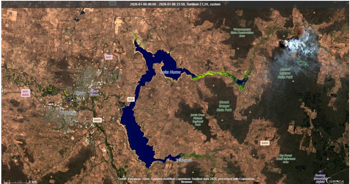
Figure 1: Hume Dam 06/01/2026 SentinelHub [CC BY-NC 4.0] NSW- RACC Custom Algae Script - TF, WaterNSW.