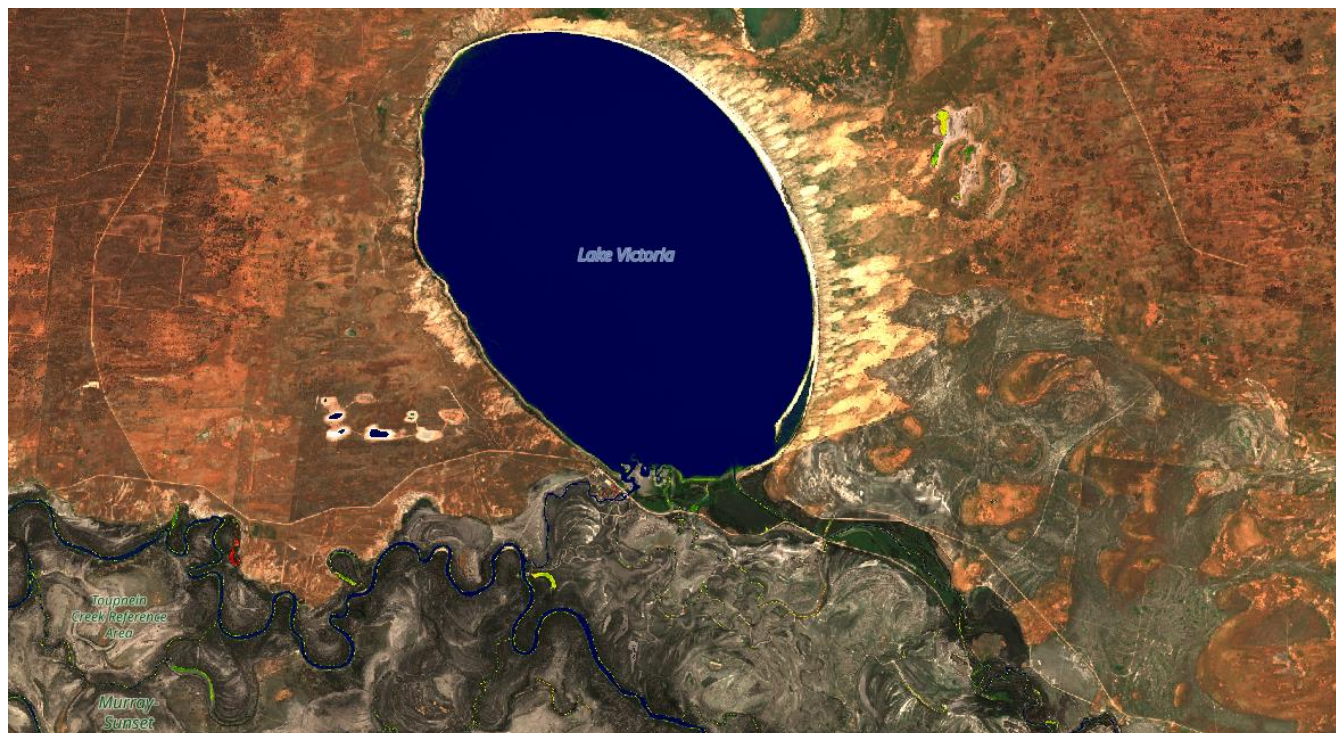
Figure 4: Lake Victoria 5/04/2026 SentinelHub [CC BY-NC 4.0] NSW- RACC Custom Algae Script - TF, WaterNSW.