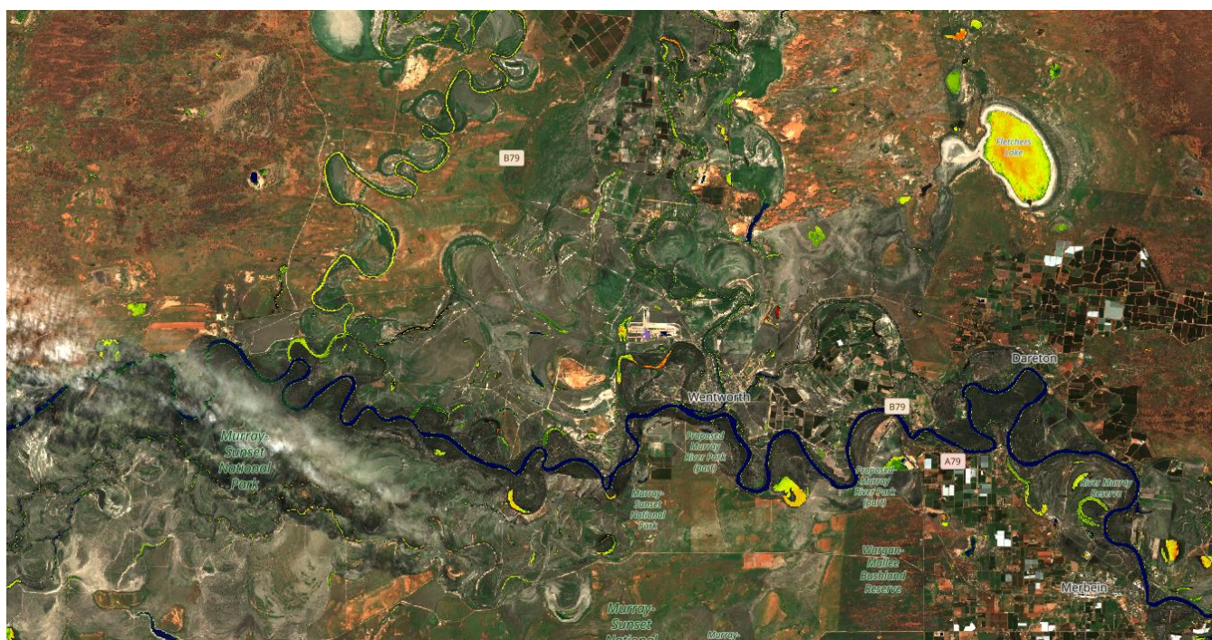
Figure 3: Murray River near Wentworth, Lower Darling River and Great Darling Anabranch 2/04/2026 SentinelHub [CC BY-NC 4.0] NSW- RACC Custom Algae Script - TF, WaterNSW.